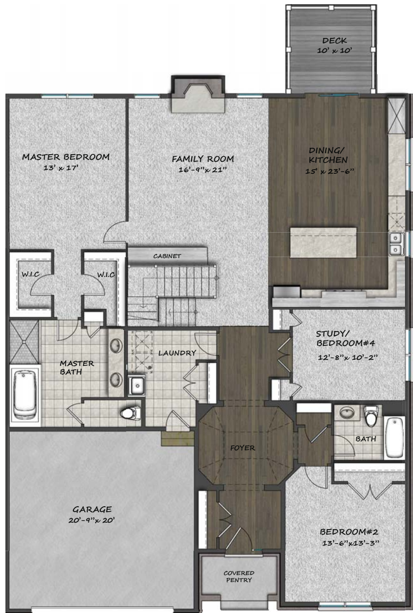
first floor plan Shown w/ Optional Breakfast Room and Family Room Cabinets